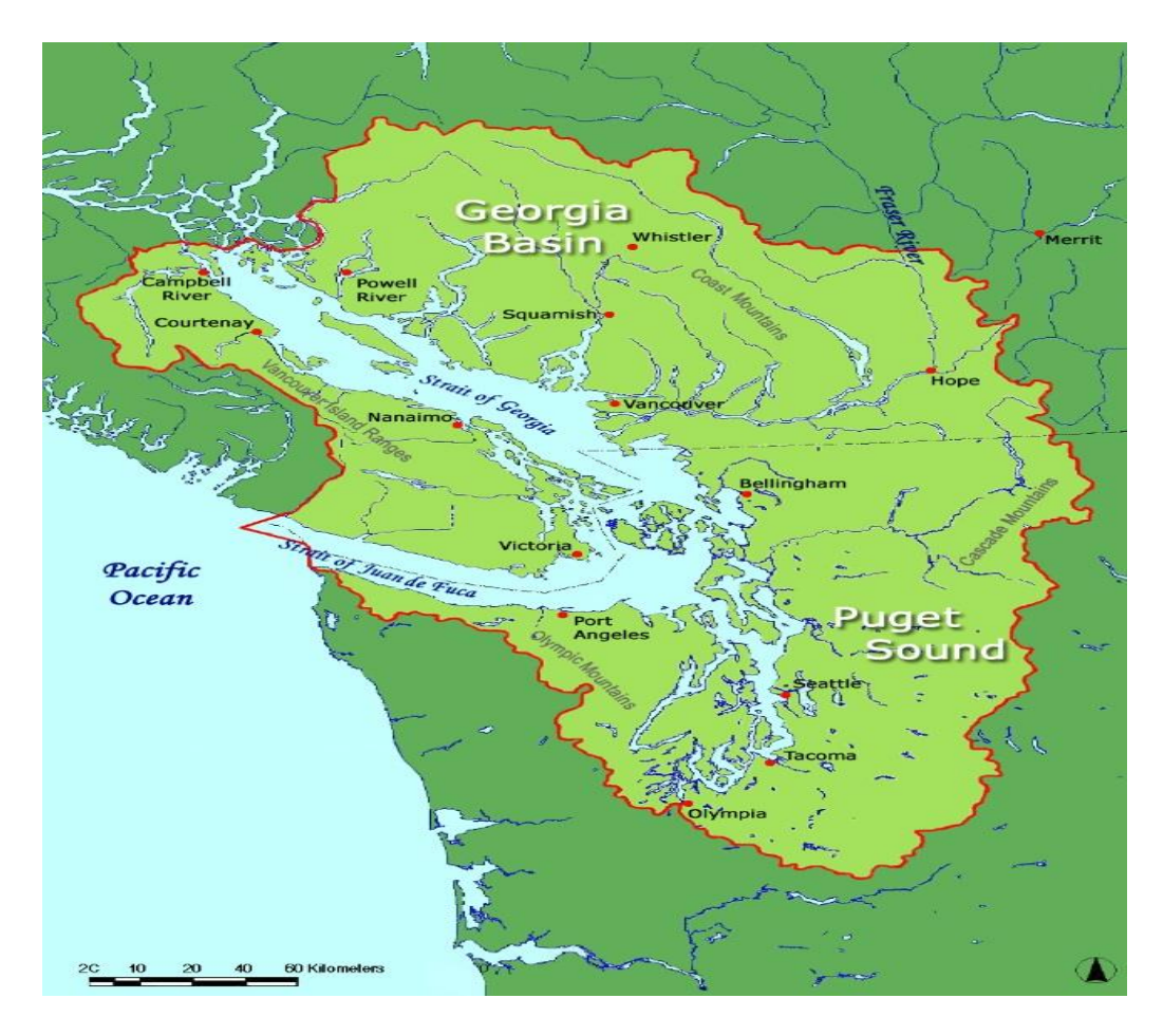
Figure 1. Puget country, the westernmost piece of the Pacific Northwest, is a natural drainage basin, its waters running into the grand inland sea, Puget Sound.